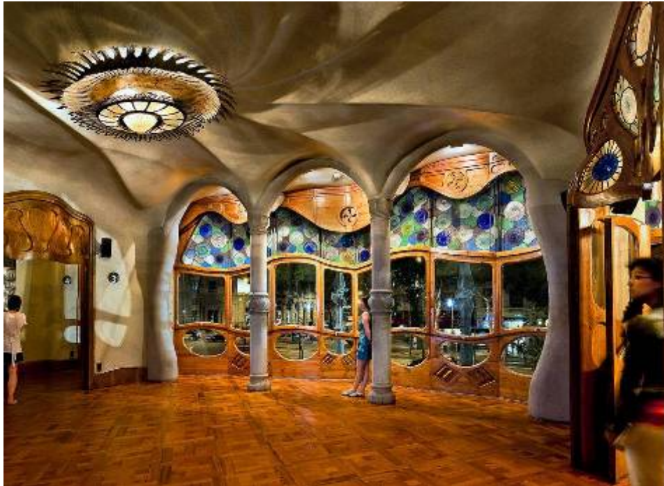
Casa Batlló (Antoni Gaudí)

A Leading International Association of Lawyers, Accountants & Tax Specialists